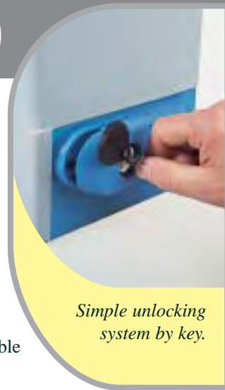
Simple unlocking system by key.