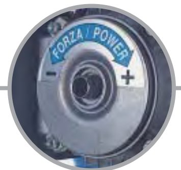
Anti-crushing safety thanks to the mechanical clutch.