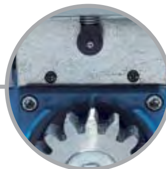
Integrated limit-switch in opening and closing.