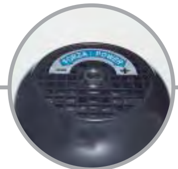
Anti-crushing safety thanks to the mechanical clutch.