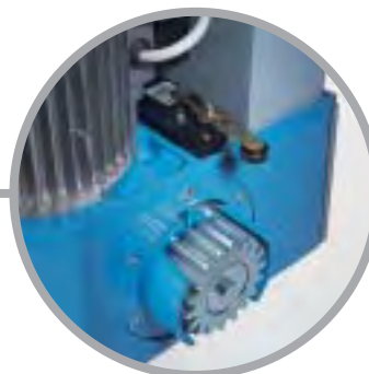
Integrated limit-switch in opening and closing.